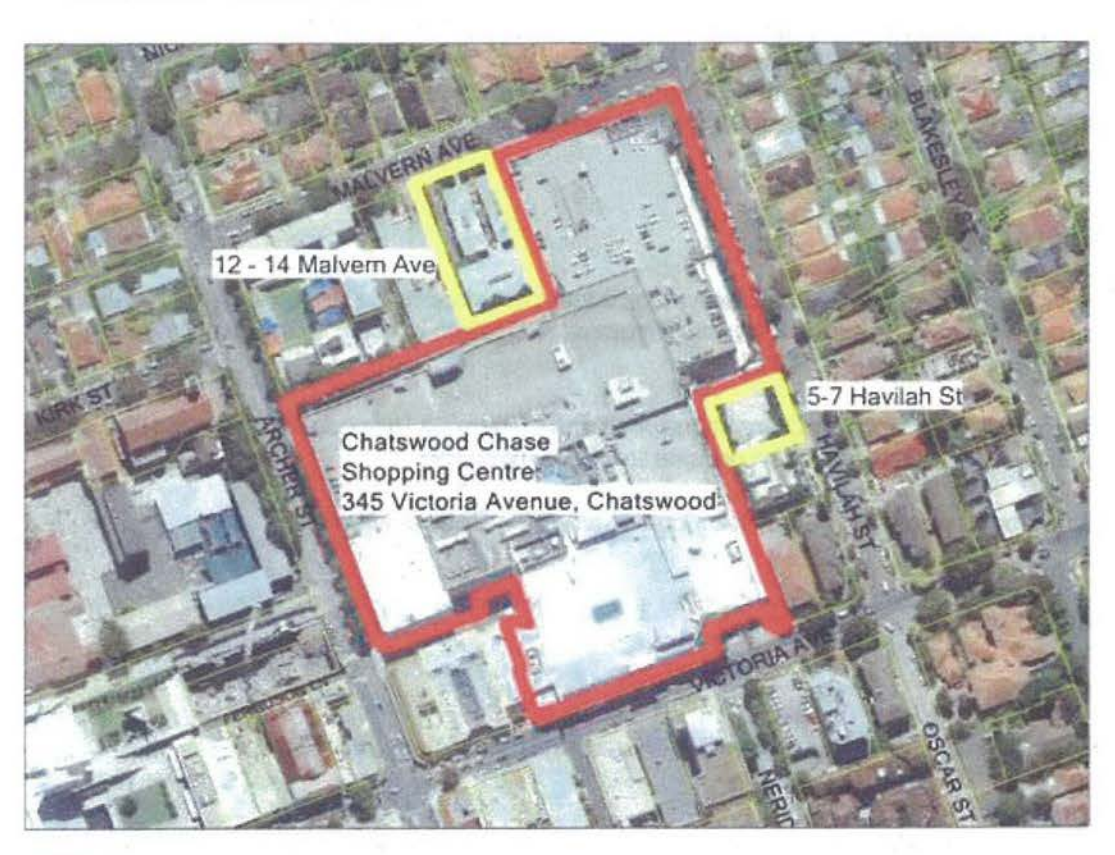
FIGURE 1: SUBJECT SITE

Chatswood Chase has operated on the site since 1983 and underwent major refurbishment in 2009.